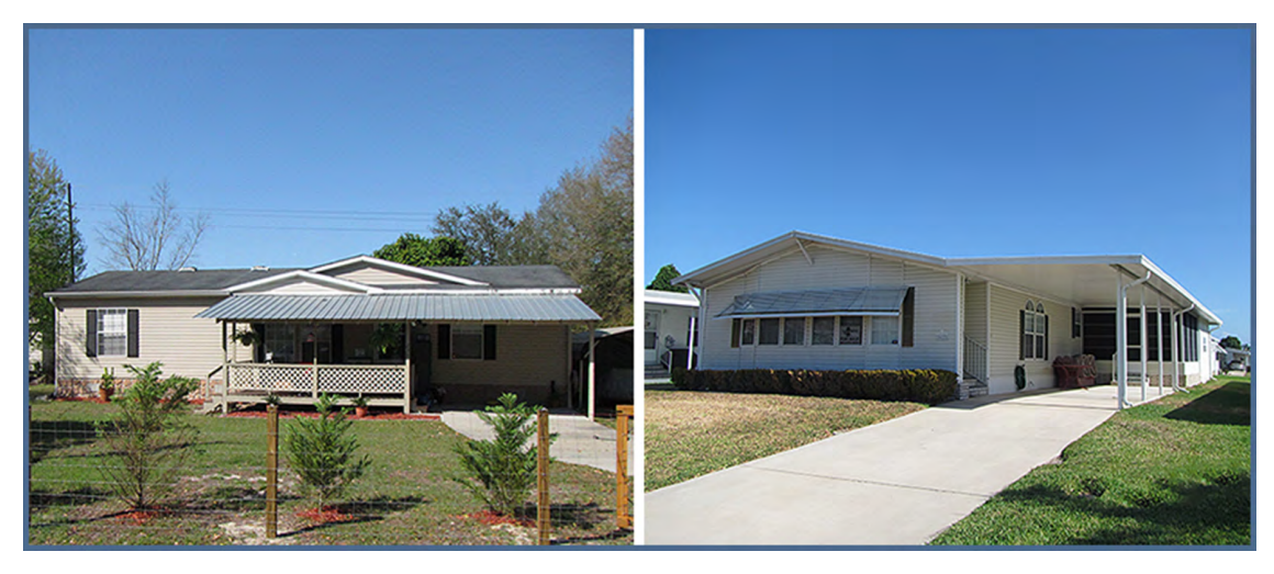
Figure 1 - Examples of mobile homes

However, if we follow the bread crumbs left for us, we can navigate the various documents governing the use of manufactured homes.