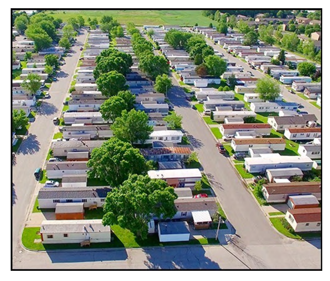
Figure 2 - Mobile home community