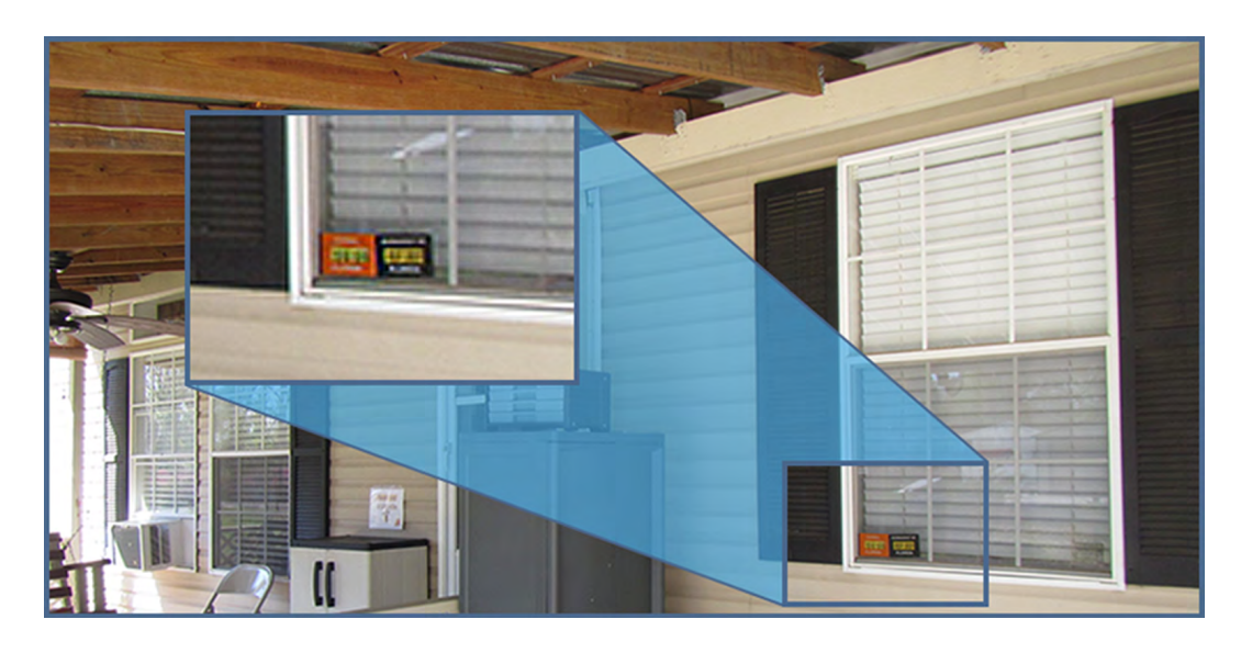
Figure 3 - Example of mobile home registration stickers

However, between the manufacturing of the structure and installation of the structure, there exists a very important phase: transportation. Given that these structures are mobile homes, the Department of Highway Safety and Motor Vehicles (DMV) also has jurisdiction over their construction, thus requiring them to be registered with the DMV. All mobile homes placed on leased property are