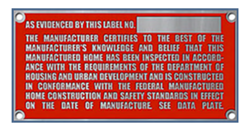
Figure 6 - Example of a mobile home certification label

As noted in item (d) above, each transportable section shall have a permanently-affixed certification label (shown below). The certification label is to be located at the taillight end of the section near the base of the vinyl siding and is blind rivetted to the siding. The label is required to be approximately 2"x4" in size and should be etched into 0.32-inchthick aluminum plate. The certification label, often refferred to as the "construction code label," is one of the easiest ways to recognize a mobile home and differentiate one from a manufactured building.