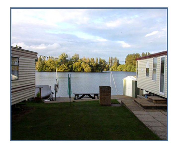
Figure 4 - Mobile homes in flood hazard area

MANUFACTURED HOME. Manufactured home means a structure, transportable in one or more sections, which in the traveling mode is 8 body feet (2438 body mm) or more in width or 40 body feet (12 192 body mm) or more in length, or, when erected on site, is 320 square feet (30 m2) or more, and which is built on a permanent chassis and designed to be used as a dwelling with or without a permanent foundation when connected to the required utilities, and includes the plumbing, heating, air-conditioning and electrical systems contained therein; except that such term shall include any structure that meets all the requirements of this paragraph except the size requirements and with respect to which the manufacturer voluntarily files a certification required by the secretary (HUD)and complies with the standards established under this title. For mobile homes built prior to June 15, 1976, a label certifying compliance to the Standard for Mobile Homes, NFPA 501, in effect at the time of manufacture is required. For the purpose of these provisions, a mobile home shall be considered a manufactured home.