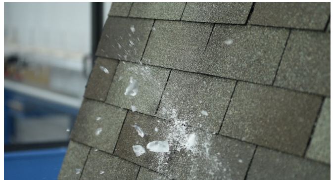
Figure 1 - Impact Testing

Regardless of the roof covering, samples are examined visually with both unaided eye and under magnification to discern punctures, tears, or bruises typical of hailstone impacts. Bituminous roofing, including built-up roofing (BUR) and modified bitumen (mod-bit), as well as composition shingles can be desaturated in a vapor degreaser and their reinforcements extracted and examined for fractures or strained regions characteristic of hail. For instance, fractures (other than anvil strike types) initiate in the lowermost reinforcement. Fractures are longest in the lowermost reinforcement and progressively shorten in reinforcements above. Plastic single-ply membranes can be examined while backlit by high intensity light. The light enables inspection of the reinforcement for fractures or strained regions within the plastic matrix without dissolving the plastic away.