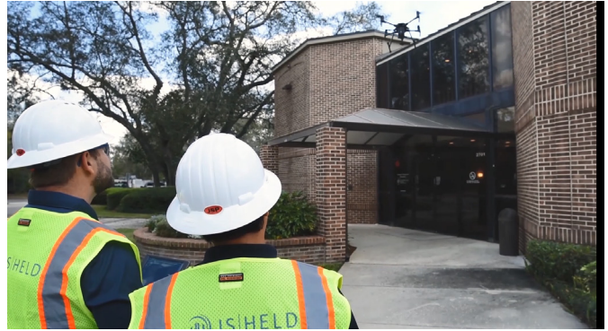
Figure 5 - Drone Assessment

Drones can be used to examine roof coverings from a close distance and the photographs/videos are high definition (typically 1080p or 4k resolution) which provides photographs with a level of detail similar to as if you were standing on the roof itself. The old adage “a picture is worth a thousand words” is even more profound when considering the vantage view from a drone hovering 100 feet above a building with a roof covering that has been removed by a hurricane. This simple picture can not only tell the story of the missing roof covering but could also provide valuable details as to complexity of repairs if access to the building was limited. Further, a drone can also assist with the documentation of roof appurtenances such as the number of HVAC units or curbs and roof features, such as chimney saddles or slope transitions.