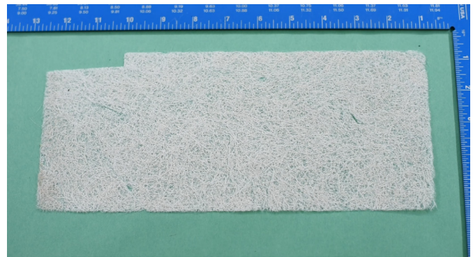
Figure 2 - Roofing Membrane After Being Desaturated in Vapor Degreaser