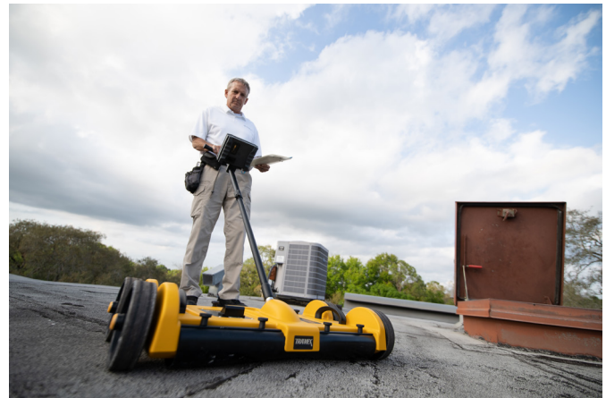
Figure 4 - Evaluating Roofing Materials for Moisture

Even on flat or low-slope roofs, it's a good practice to have a spotter on the roof with the IR camera operator since the operator can be easily distracted and not be cognizant of dangers involved in roof inspections. It's also important to identify on a diagram the location of the area(s) of IR images to later document where the IR images were taken.