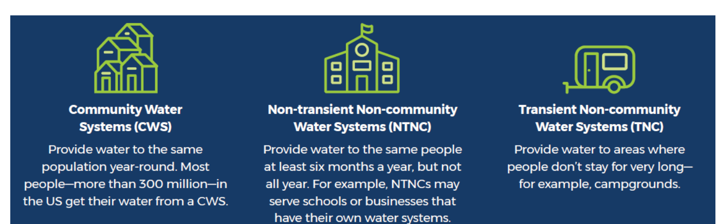
Figure 1 - U.S. public water system types.

There are approximately 155,693 public water systems in the United States.<sup>1</sup> They are classified in three tiers: